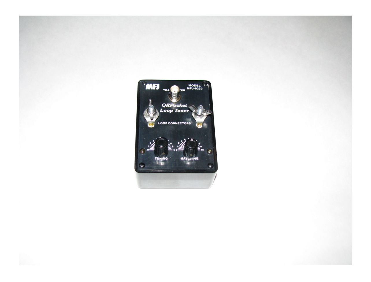
Figure 1: MFJ-9232 Mini Loop Tuner