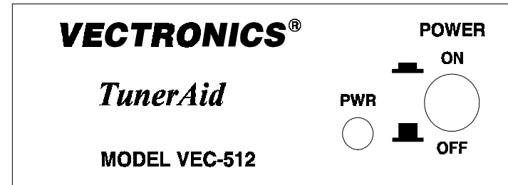
VEC-512 Front Panel

transceiver! Remember to turn the power to the VEC-512 OFF before using your transceiver.